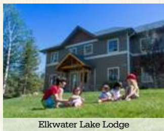
Elkwater Lake Lodge