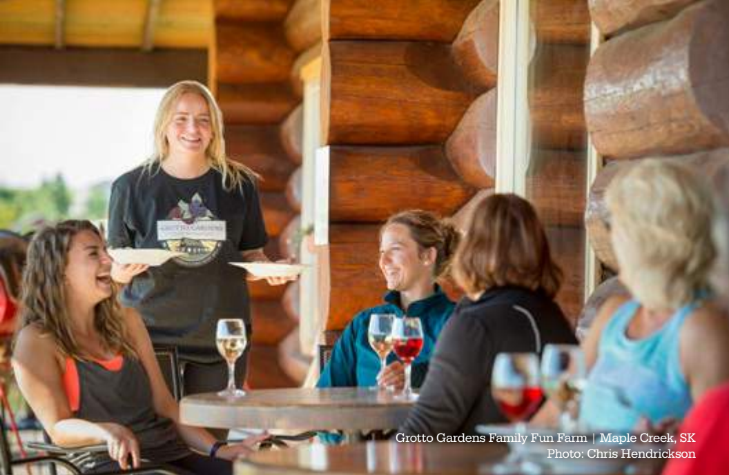
Grotto Gardens Family Fun Farm | Maple Creek, SK