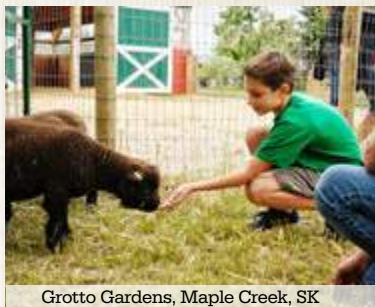
Grotto Gardens, Maple Creek, SK

See them all at www.visitcypresshills.ca