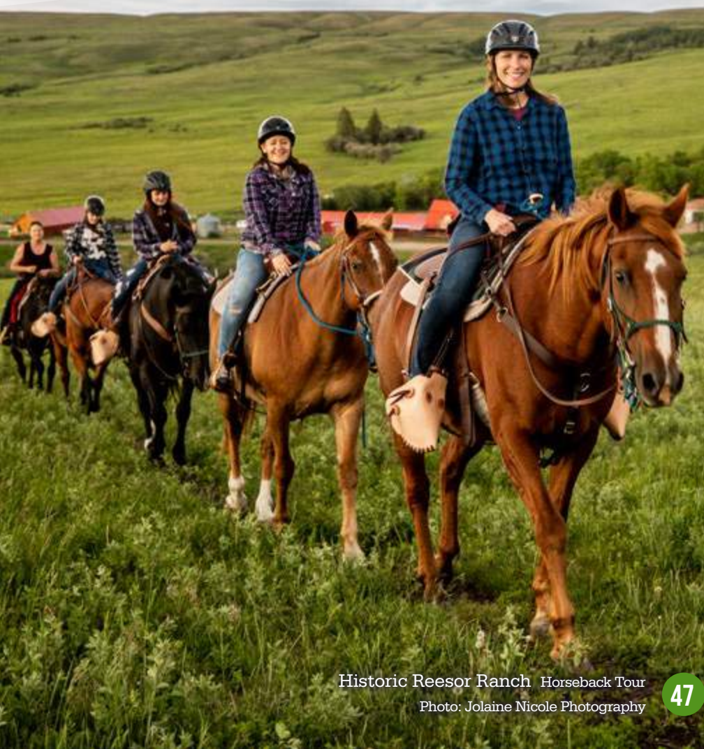
Historic Reesor Ranch Horseback Tour

Head out for guided hikes, horseback riding, ATV tours, kayaking and golfing, or take a roll through the woods on a Segway Tour! Taste a NEW craft brewery tour, or zen out with the ever-favourite GOAT YOGA and Paddle & Yoga Picnics! See them all at www.visitcypresshills.ca