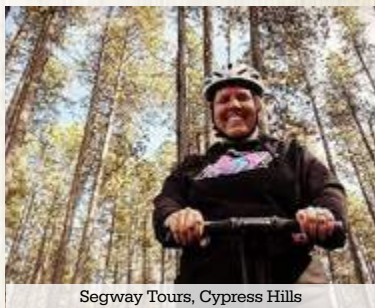
Segway Tours, Cypress Hills