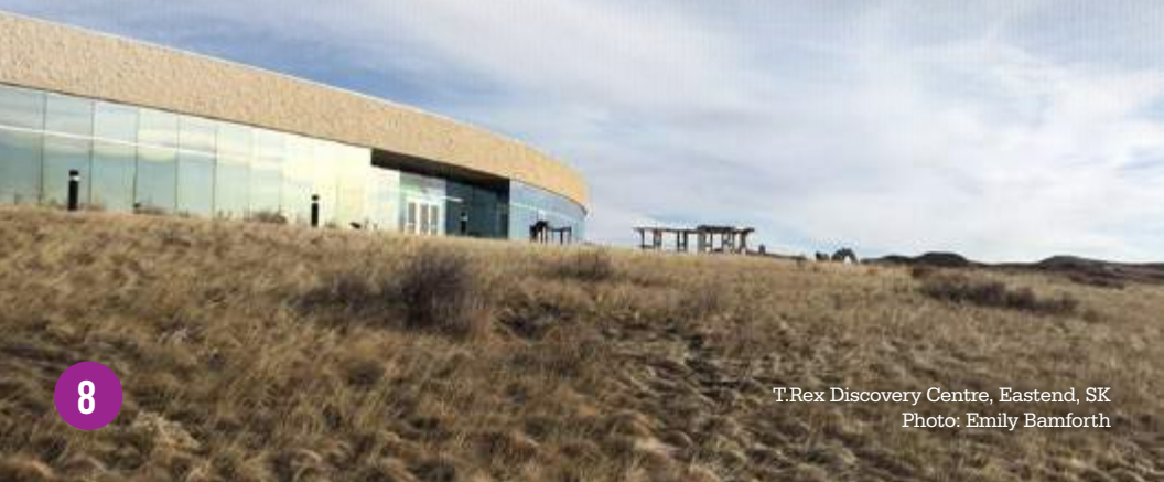
T.Rex Discovery Centre, Eastend, SK