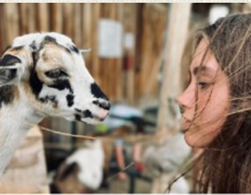
Grotto Gardens, Maple Creek, SK

See them all at www.visitcypresshills.ca