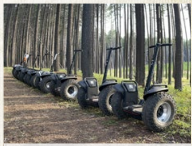
Segway Tours, Cypress Hills